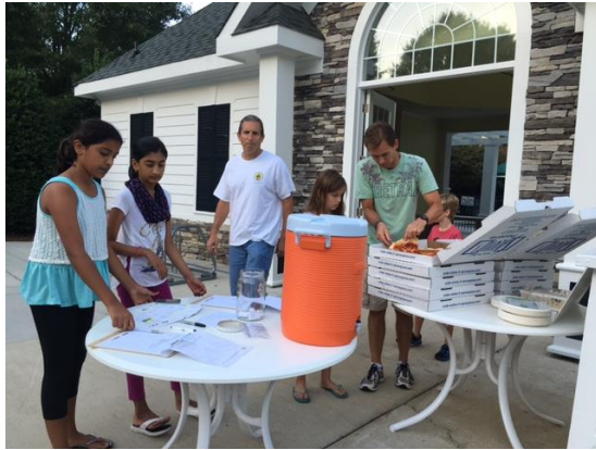
Figure 2: Youth signing-in