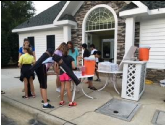
Figure 1: Residents signing-in