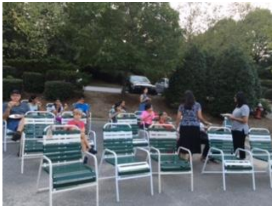
Figure 3: Residents settling down and enjoying the food.