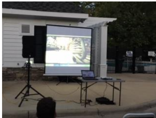
Figure 6: The movie.