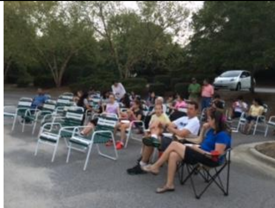
Figure 4: Waiting for the sunset so that movie can begin.