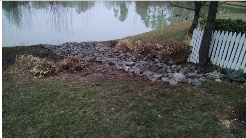
Above photo: AFTER