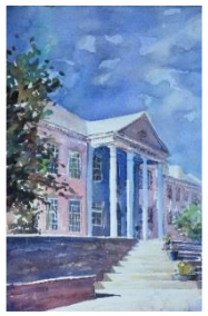
2 nd place "Cary Arts Center", Watercolor, by Ryan Fox