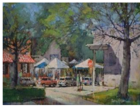
3 rd Place "Farmers Market Morning", Oil, by Dan Nelson