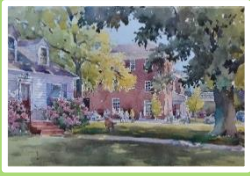
1 st place "New Neighbor" Watercolor, by JJ Jiang