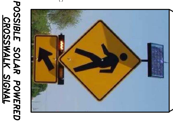
POSSIBLE SOLAR POWERED CROSSWALK SIGNAL