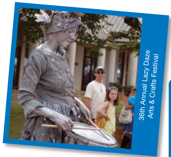
36th Annual Lazy Daze Arts & Crafts Festival

3 p.m. – till Dark – Koka Booth Amphitheatre Don't forget the fireworks at Koka Booth Amphitheatre , 8003 Regency Parkway Cary, NC 27518 (919) 462-2025.