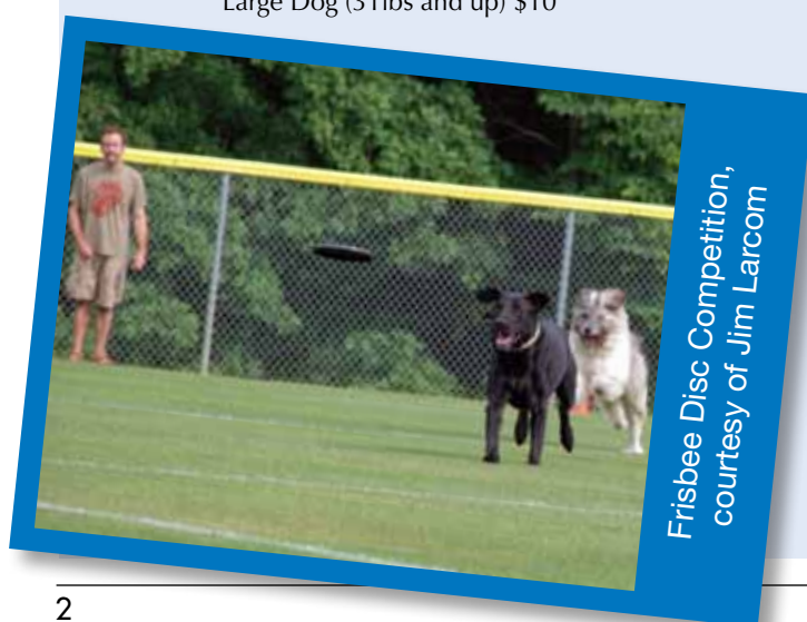
Frisbee Disc Competition, courtesy of Jim Larcom