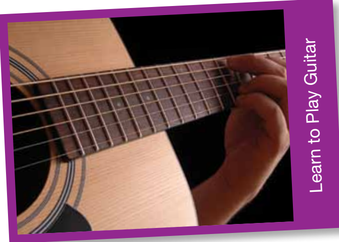
Learn to Play Guitar