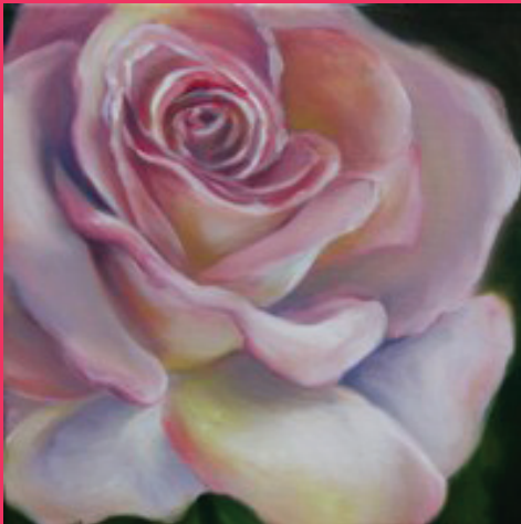
Constance Belton (2011 Art55 medalist)